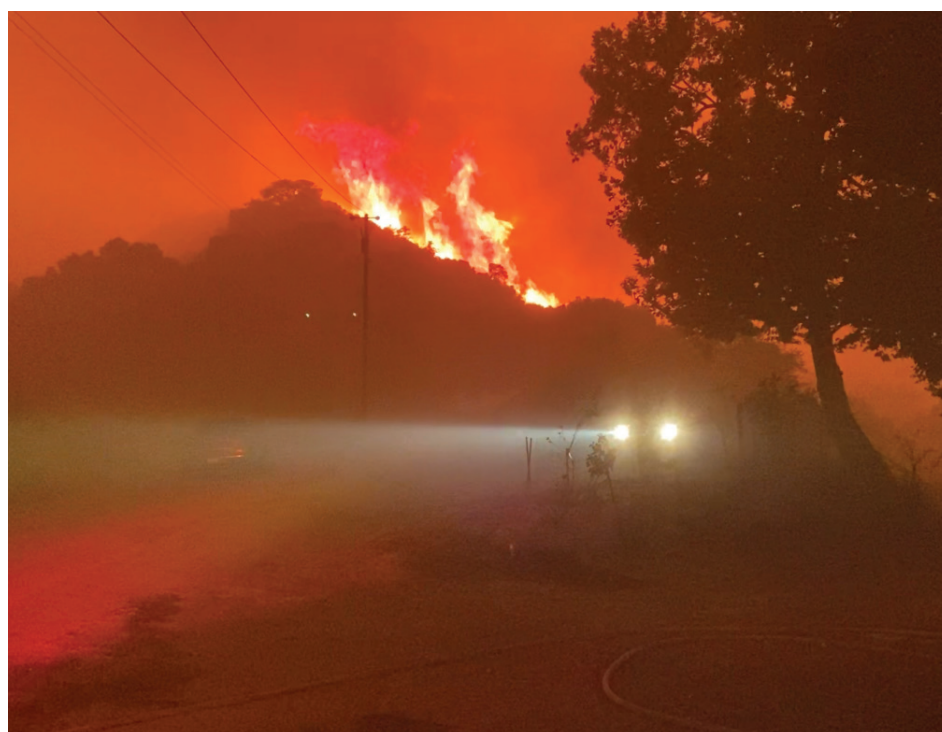
Firefighter Jimmy Hart

The primary fuel sources that can make a fire worse include dry organic matter, such as dry bushes, grass, and dead trees. To starve the fire of fuel, firefighters remove any dead organic material that might feed the fire, a process which